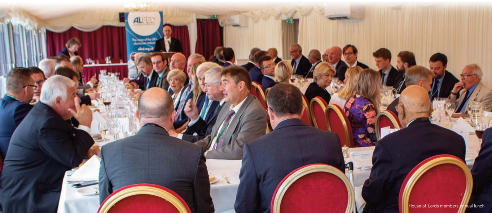
House of Lords members annual lunch

We give you a unique opportunity to get your voice heard – within the industry and in government. Whether you're a global company or an SME, you can advocate and influence to improve market conditions for your products and services.